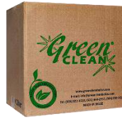
Green Clean & Septic Aid Products

g) 5L at (5L x 1) presentations → Multipurpose Cleaners only