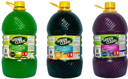
3 Fragrances (Green Apple, Citri-boom, Lavender)

g) 5L at (5L x 1) presentations → Multipurpose Cleaners only